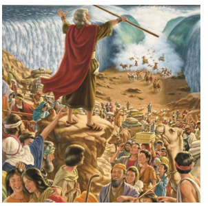
Goal: To trust that God works for people who struggle for freedom and justice.