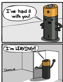
My battery ran out.