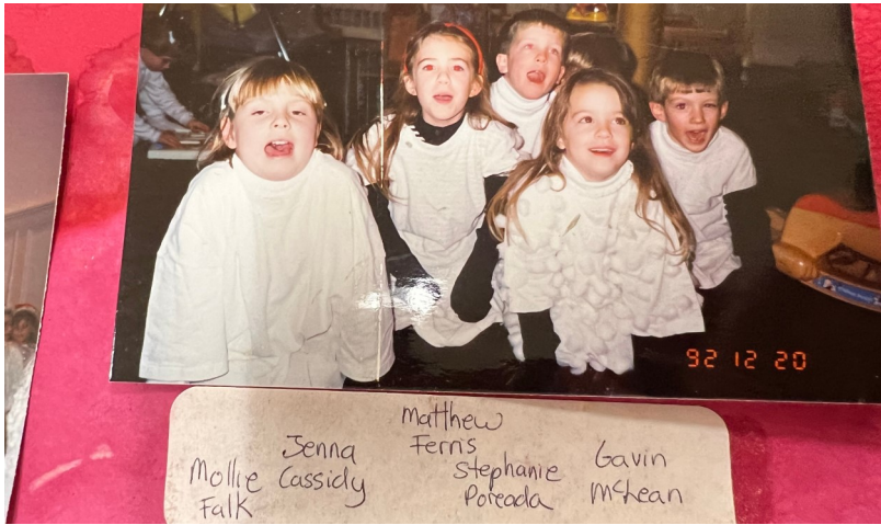
Children bleating like sheep during 1992 Christmas Eve service