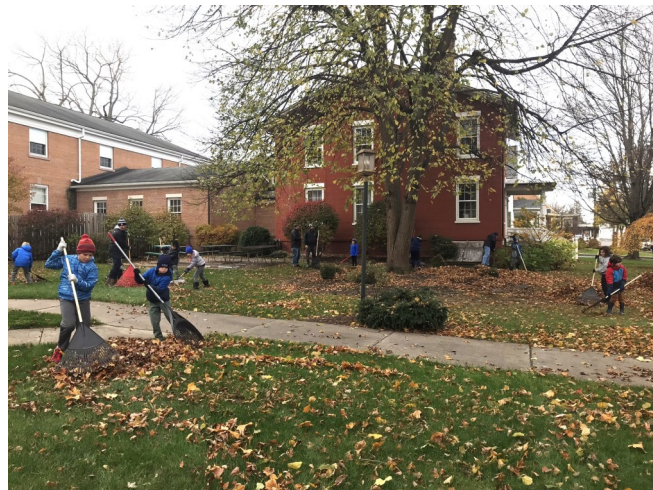
On Saturday, November 11, Cub Scouts from Packs 171 and 341, both sponsored by FPC, raked leaves and picked up black walnuts from the church grounds. Their efforts are appreciated by all.

We offer the opportunity to honor, remember, or thank someone you love with a dedication and donation toward the purchase of poinsettias for church. A booklet of the dedications will be available by Christmas. For a donation of $10 each, dedication forms can be filled out after both church services on December 3, 10 and 17. Dedications and donations may also be made on our website. Donations beyond the purchase price of the poinsettias will go toward Presbyterian Women’s mission projects. The poinsettias themselves will be available following the 10:30 pm service on December 24 on a first come basis.