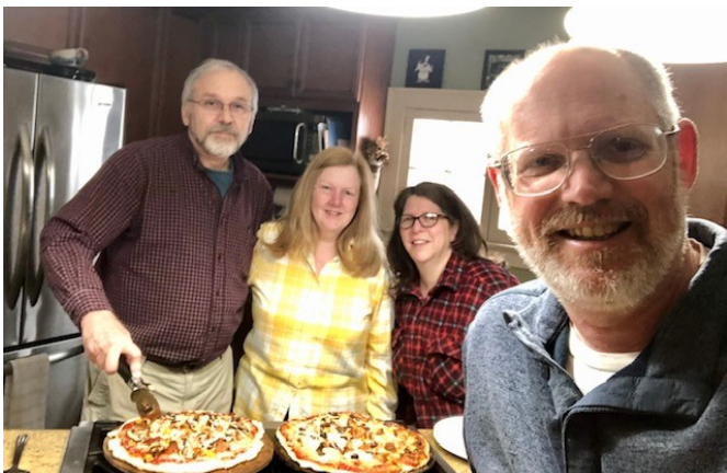
Fun times at the March Deacon Cooking Club!