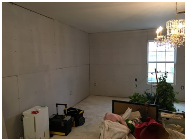
One room of the house before..... and after.

Pastor Nominating Committee - Update - We have received our first batch of prospective ministers from PCUSA Headquarters. We will be conducting first round phone interviews in the upcoming weeks. Keep our committee in your prayers.